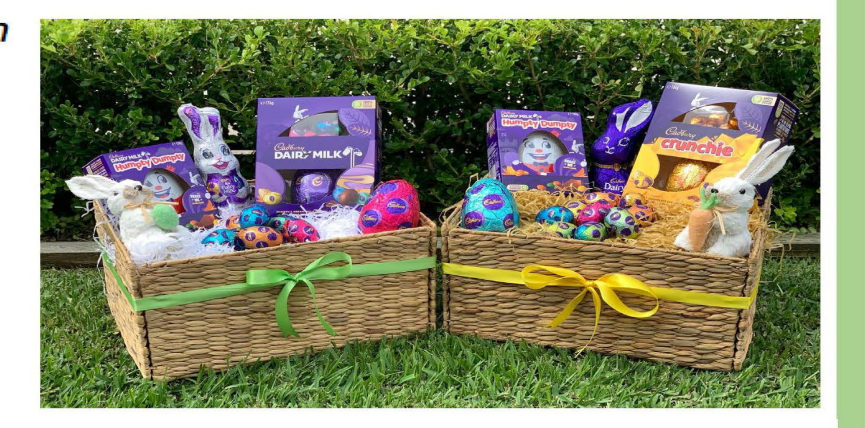
<u>3rd and 4th prize</u> -2 x Kids Easter Fun Baskets (value $50 each)