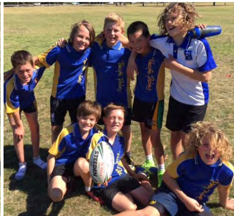
Senior Boys Team