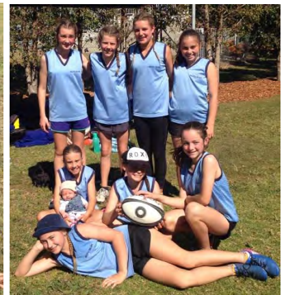
Senior Girls Team