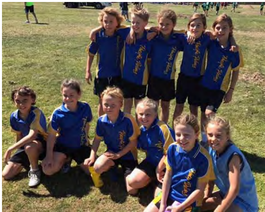
Mixed Junior Team

Last Friday, our school sent three teams to the Manning Zone Touch Football Gala Day. In very hot and dusty conditions, the mixed junior team played very well and improved with every game, finishing with 2 wins, 2 losses and 1 draw. The senior boys' team came up against some schools with much more touch football experience. To their credit, each game they learnt more about the tactics of the game and how to drive for field position before moving the ball around on the final plays. They ended the day winning 1 game and 4 losses. The senior girls' team was a perfect example of what the day was about - playing as a team and having a great time! They also won 2 games, lost 2 and had one draw. A huge thank you to all parents who helped with transport and coaching tips on the day!