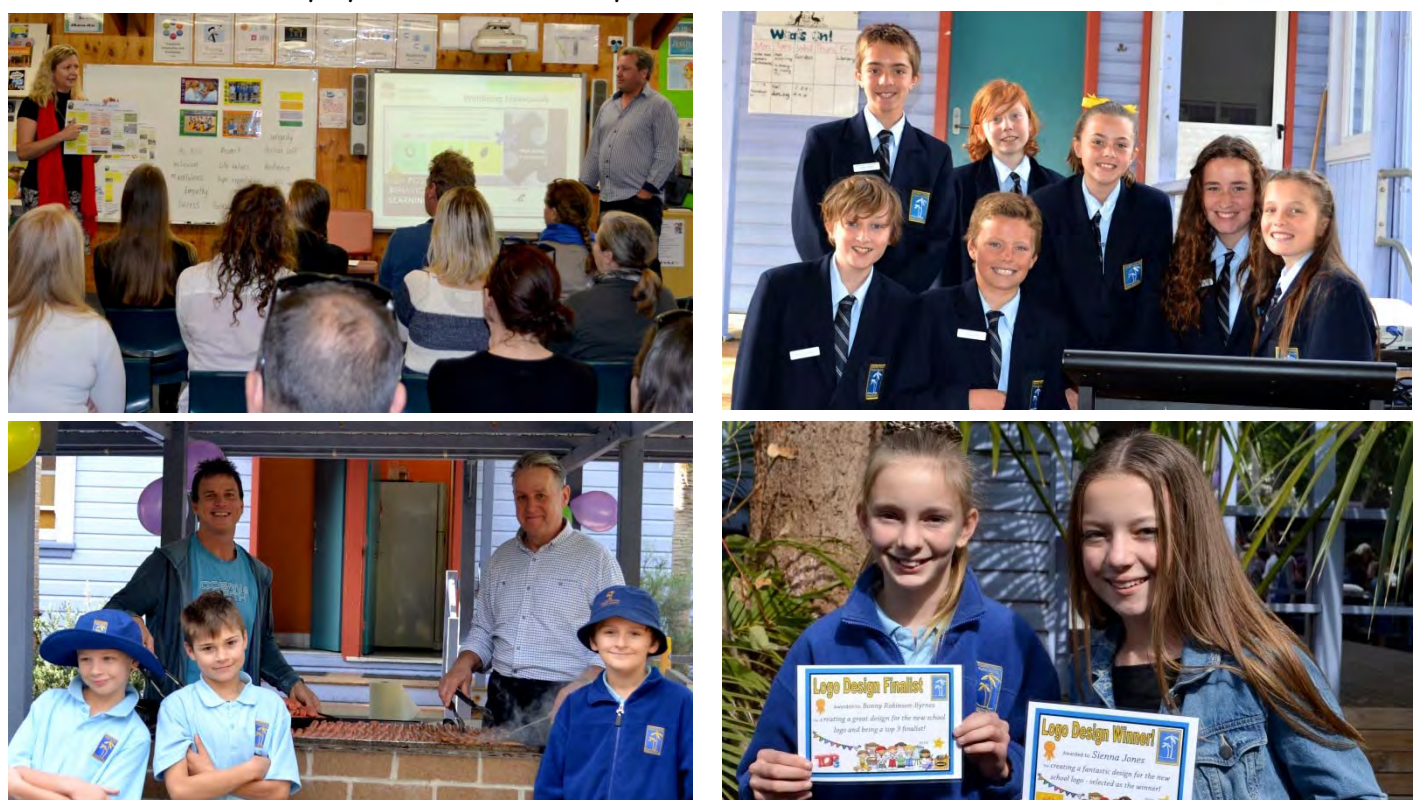
RESPECT IS THE KEY