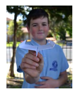
plane that flew for 11.36 seconds.