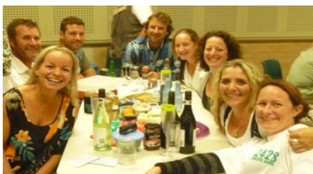
Second place table