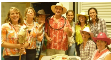
Best "Dress up" table